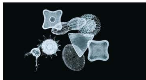
High-magnification microscopic photo of algae fossils.

Algae were some of the first organisms to emerge on our planet over three billion years ago. All subsequent life forms have depended upon these single-cell aquatic plants for their survival because algae generate 80% of the global oxygen supply. Being at the beginning of the food chain, algae are an incredible source of densely packed, broad-spectrum nutrition. Algae are approximately 60% to 70% protein, and unlike other plant-based protein, algae's protein is complete and is thus ideal for humans. The only other source of complete protein, meat, is approximately 20% protein. Moreover, because algae supply enzymes, their proteins are easily digested and absorbed.