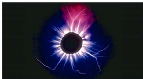
The radiant electromagnetic energies of Synergized® Algae are captured on film with a Tesla-coil 200-pulse Kirlian research camera.

Pharmaceutically Grown Algae Pure Chlorella™