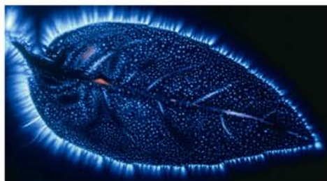
The radiant electromagnetic energies of Synergized® Herbs are captured on film with a Tesla-coil 200-pulse Kirlian research camera.

100% Certified Organic Freeze-Dried Powders Burdock, Ginkgo, Nettle, Parsley, Red Clover, Skullcap, Yellow Dock