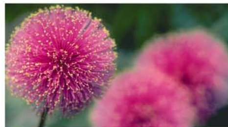
Synergized® Herb in full bloom.

“Freeze-dried extracts of the medicinal plants are the best preparations to buy . . . These products are concentrated and stable.”