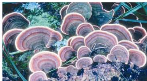
Beautifully formed wild medicinal mushrooms.

Medicinal mushrooms have been treasured for 7,000 years as profound healing agents. Unlike many other traditional remedies, though, mushrooms have been shown in numerous modern scientific studies to possess medicinal properties. Seven mushrooms in particular have demonstrated remarkable health benefits: the Asian mushrooms Cordyceps sinensis (cordyceps), Hericium erinaceus (lion's mane), Coriolus versicolor (turkey tails), Ganoderma lucidum (reishi), Lentinula edodes (shiitake) and Grifola frondosa (maitake) and the Brazilian mushroom Agaricus blazei .