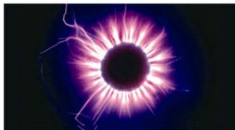
The radiant electromagnetic energies of Synergized® Mushrooms are captured on film with a Tesla-coil 200-pulse Kirlian research camera.

Agaricus blazei, Cordyceps, Lion's Mane, Maitake, Reishi, Shiitake, Turkey Tails; extracts and standardized extracts